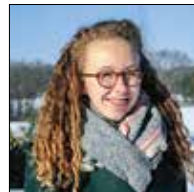
Mae Hovland Rotary Study Abroad – Japan