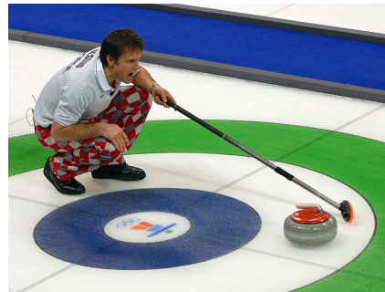
Thomas Ulsrud, skip of the Norwegian curling team, at the Vancouver 2010 Olympics.

The Norwegian team, named Team Ulsrud after skip (captain) Thomas Ulsrud, has restyled the world of curling by attaining media attention at the 2010 Vancouver Winter Olympics with their colorful trousers. The team went on to win the silver medal in Vancouver but did not place in the 2014 Sochi Olympics. Canada has been a strong rival for Norway but in 2002 Norway took home the gold.